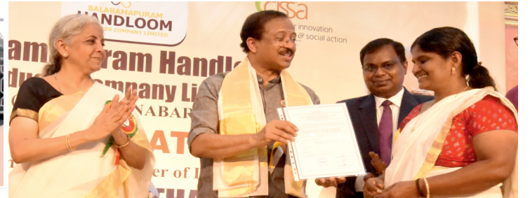
Union Minister of State V Muraleedharan distributing share certificates

just saris, it should be possible to weave out all needed household items from the handloom. Such a move will not only energise the market for handlooms but also strengthen the international markets for the native yarn, the Minister said.