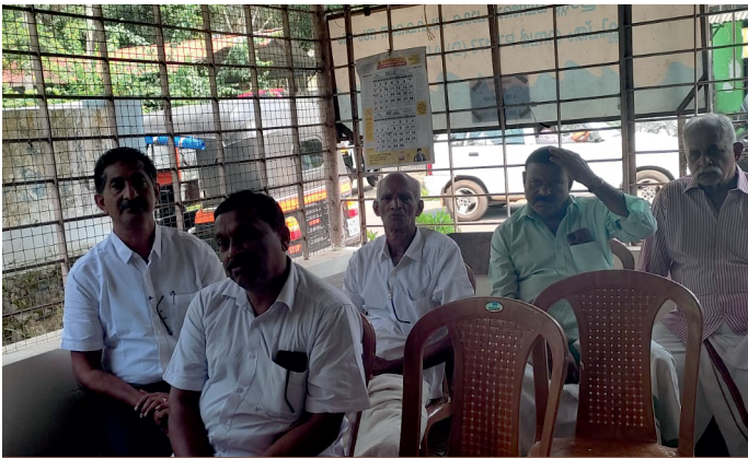
FIG meeting in Pavithreshweram, Karinbinpura