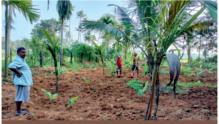
Banana cultivation started by Sreelekshmi FIG under Chenganoor FPC in Cheriyanad Panchayat