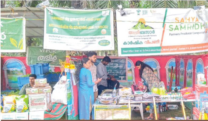
Sahya Samridhi FPC's stall at the function in Kollam organized by the state government to honour farmers