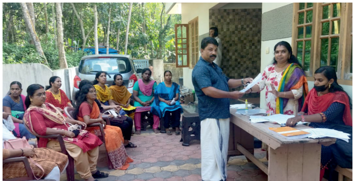
Distribution of share certificates organised by BHPCL