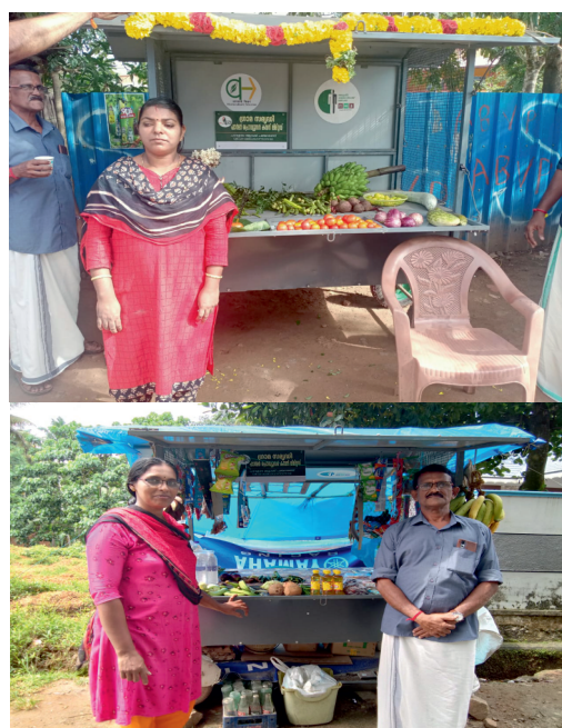
Parassala Grama Samridhi Farmers Producer Co. Ltd. provided Vending cart for selling vegetables to Differently abled Youngsters of Chenkal Grama Panchayat