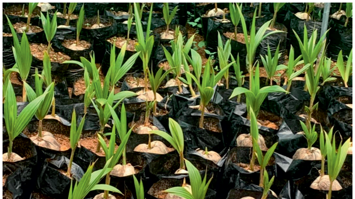
Coconut saplings readied for sale at the coconut nursery run by Chiranyinkeezh FPC