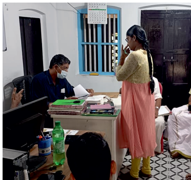
DMI officials at Pothankot FPC Interacting with Board of Directors members