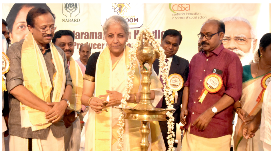
Hon'ble Union Minister of Finance Nirmala Sitharaman inaugurating the Balaramapuram Handloom Producers Company Ltd. Hon'ble Union Minister of State V Muraleedharan also seen.

The Balaramapuram Handloom Producers Company with members of the weaving community as its shareholders is a historic step in the right direction, said Union Finance Minister Nirmala Sitharaman. The formation of the Company will help in reaching out benefits to each and every weaver, the Union Minister said while speaking at the formal inauguration of the Producer