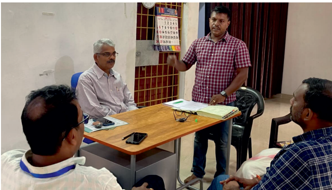
Board meeting of Mavelikkara F.P.C