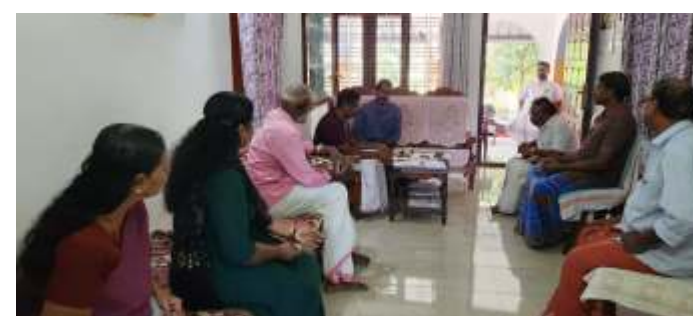
FIG meeting with members of Mannar and Melpadam regions under Mavellikara FPC