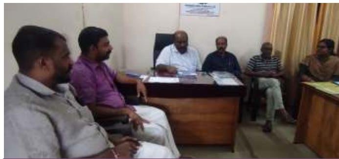
Board Meeting of Mullappally FPC