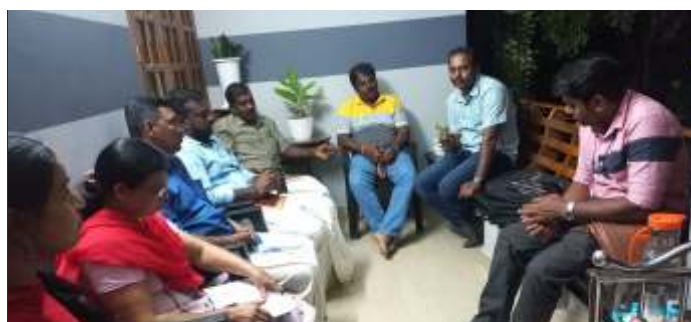
Board Meeting of Mukhathala FPC