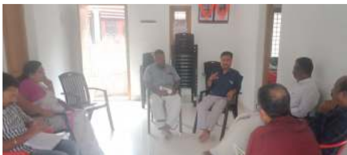
Board Meeting of Pathanamthitta FPC