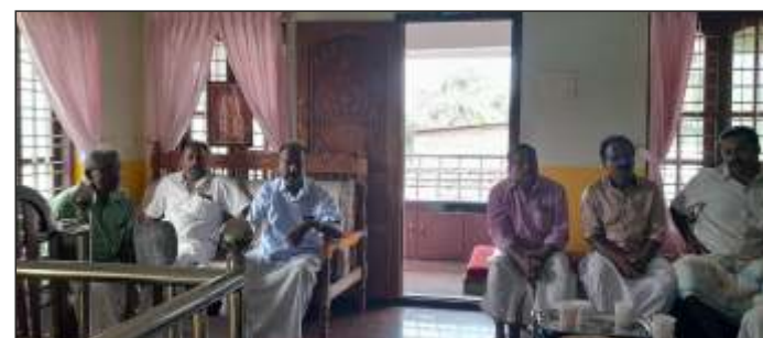
The Pavithreswaram Karimbinpuzha FIG meeting of K