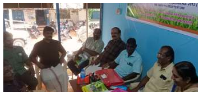
Board Meeting of Pandalam FPC