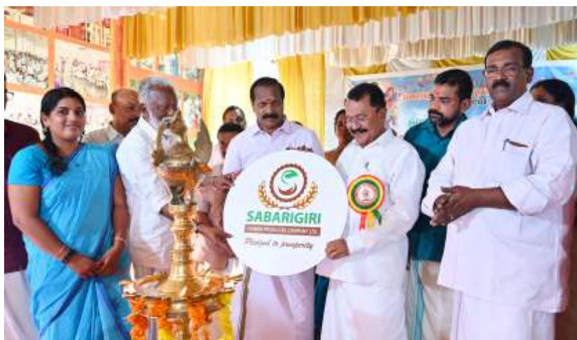
Goa Governor PS Sreedharan Pillai launching the logo of Sabarigiri FPC in the presence of Former Mizoram Governor Kummanam Rajasekharan.

The main aim of farmer producer companies is to make farmers excellent producers and to bring maximum income for them. Such companies can play a cardinal role in converting commodities to value-added products and to reach them to the consumers directly, said Goa Governor PS Sreedharan Pillai speaking after the logo launch of Sabarigiri FPC.