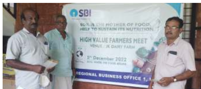
About the AKA project organized by Chattanur SBI When Desinganadu FPC representatives were invited in the program